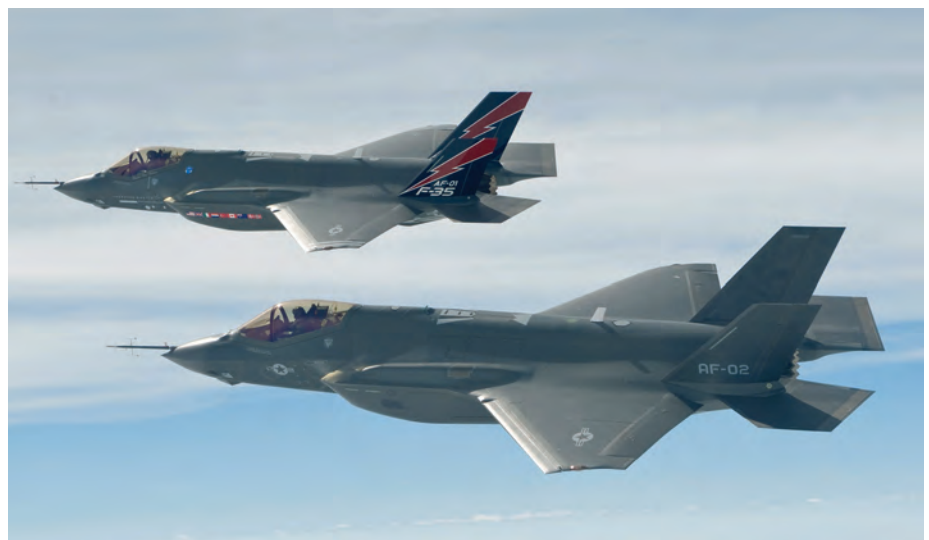
Lockheed (David Drats)

Unfortunately, the current inventory of conventional U.S. long-range strike systems provides a limited range of options and displays a force declining in quantity and quality. The